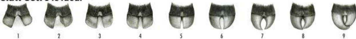
Figure 1. Foot scoring system for Foot Angle and Claw set.