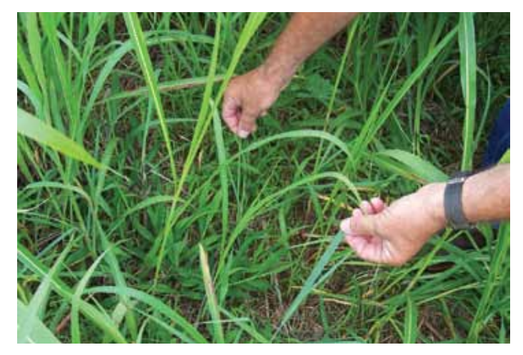
Fig 3. Even though large switchgrass seedlings (being held in each hand, above) have developed as a result of this planting, the weed canopy was allowed to overtop the seedlings. When this occurs, there is little chance of a successful stand. These weeds MUST be controlled in a timely manner.

With a seedling stand of acceptable density, your remaining challenge during the summer is to ensure seedlings have reasonable relief from weed pressure. The key is to not allow weeds to form a canopy above the seedlings (Fig. 3). A few scattered weeds are not much of a concern. Dense stands of johnsongrass, signalgrass, crabgrass or broadleaf weeds, on the other hand, can be a serious problem and can easily result in the loss of the stand. The best way to handle this is to regularly inspect your field in the weeks following planting. Be prepared to either clip or spray weeds as needed. Timeliness is critical. Some herbicides that control broadleaf weeds can damage smaller grass seedlings. When clipping, be sure to keep your mower above the developing seedlings. You may be