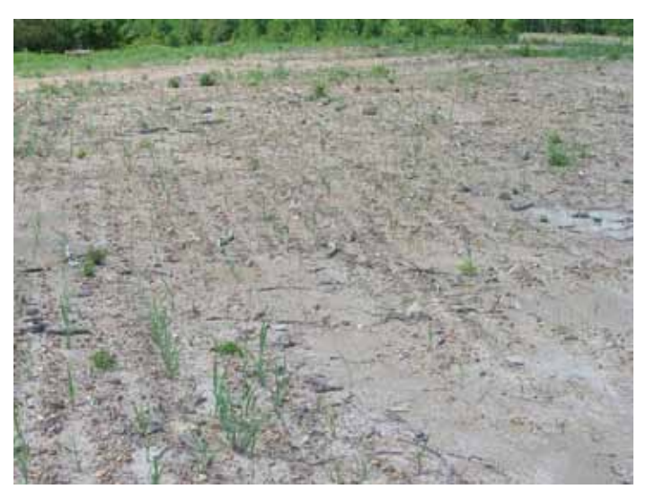
Fig 1. Native grass seedlings are slow to develop. However, on this clean, firm, conventionally prepared seedbed, these small seedlings will develop into a goodquality forage stand.

Broomsedge, johnsongrass and dallisgrass can all compete aggressively with NWSG. Where any of these are an issue, plan to spray during August the year BEFORE planting. For johnsongrass or broomsedge, 1 - 2 qt/ac (for 4 lb active ingredient/gal formulations) glyphosate will be adequate, but for dallisgrass or bermudagrass (see sidebar, "Controling bermudagrass"), rates of up to 5 qt/ac will be