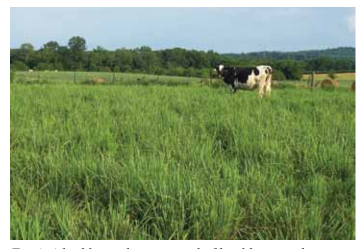
Fig 4. A highly productive stand of big bluestem during an unusually hot summer is providing excellent forage. Attention to detail lead to this successful third-year stand.

By the second year (12 months post-planting), your NWSG will be well-established, but not mature. Regardless, they will be quite competitive with most weeds. There are a few situations though, that may bear some attention. If the first-year stand was slow-developing, weeds may have become well-established. Most annuals will not be an issue during year two. But other weeds, especially johnsongrass and broadleaves, should be sprayed during the spring. For bluestems and indiangrass, heavier rates of imazapic (up to 3 oz active ingredient/ac) can be used to control many of these weeds. For switchgrass, nicosulfuron + metsulfuron (Pastora <sup>®</sup>) applied at 1.0 oz/ac of product provides good control. Also, any number of broadleaf-