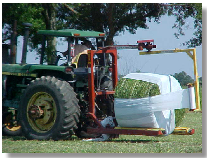
Figure 1. Picture of individual bale wrapper.

There are two major ways to store forage as baleage: through use of an individual bale wrapper (Figure 1) or an in-line wrapper that continuously wraps bales (Figure 2). Significant differences exist between the two systems. Most notably, the individual bale wrapper generally costs less and runs on the hydraulics of the tractor towing the wrapper, but it does not wrap bales as quickly (three to six minutes per bale), requires more labor, and uses more plastic (20-25 bales per roll of plastic). In contrast, the in-line bale wrapper costs significantly more, runs on its own gasolinepowered engine, wraps bales substantially quicker, and uses less plastic (30-40 bales per roll of plastic). Trailed versions of the individual bale wrappers can be operated with a 45-50 horsepower tractor or more. A 75 horsepower tractor is recommended, however, for the in-line wrappers, because the