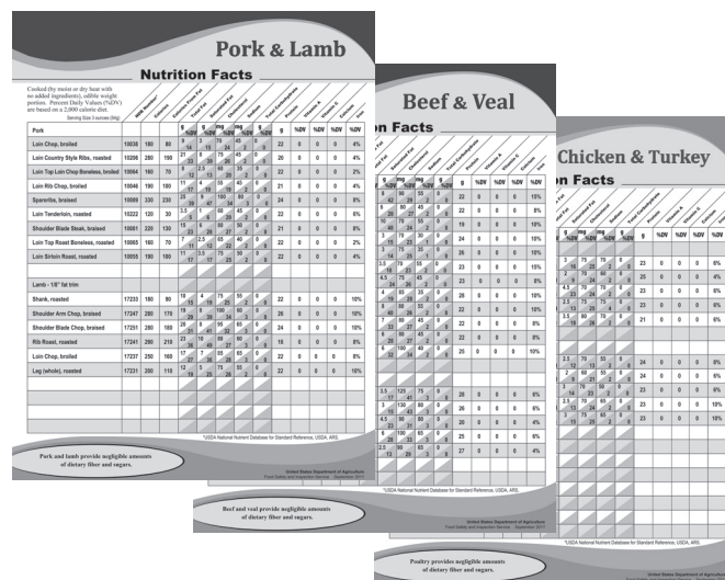
Figure 1. Example Nutrition Charts Available from USDA FSIS

Additional information is available on the USDA FSIS Nutrition Labeling web page ( http://www.fsis.usda.gov/wps/portal/fsis/topics/regulatory-compliance/labeling/labeling-policies/nutrition-labeling-policies/nutrition-labeling ).